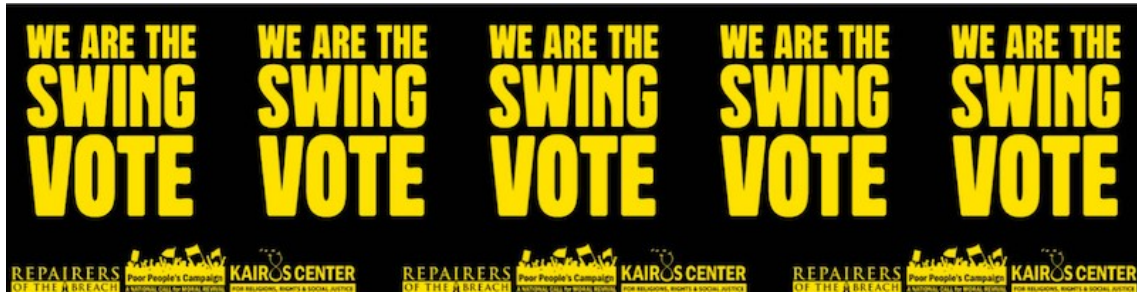
Table time! Canvass o'clock!

With less than six weeks until Election Day, California PPC is taking to the streets to Get Out The Vote! Join one of our upcoming actions or start your own canvassing events. We've got all you need to know right here.